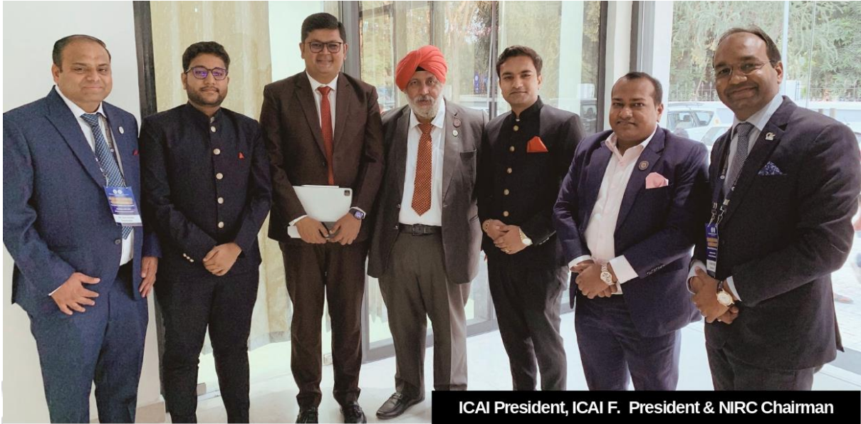
ICAI President, ICAI F. President & NIRC Chairman