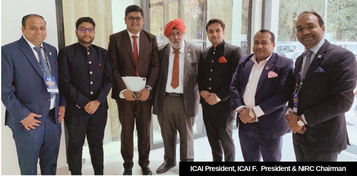
ICAI President, ICAI F. President & NIRC Chairman