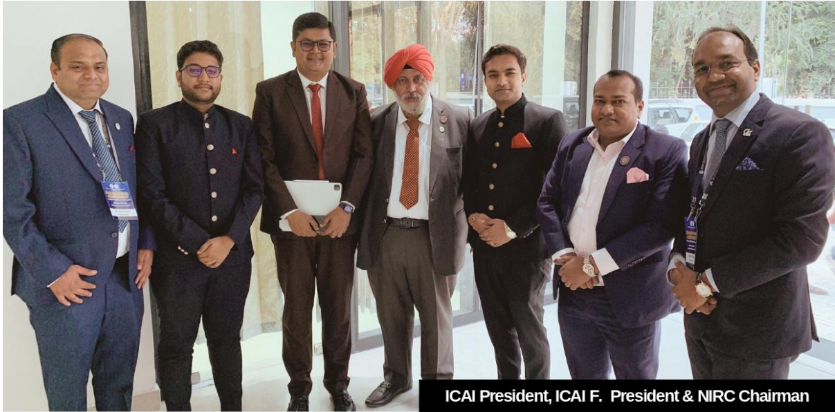
ICAI President, ICAI F. President & NIRC Chairman