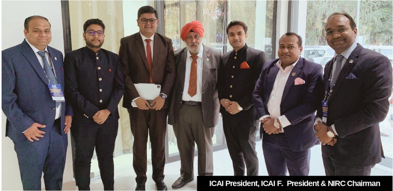
ICAI President, ICAI F. President & NIRC Chairman