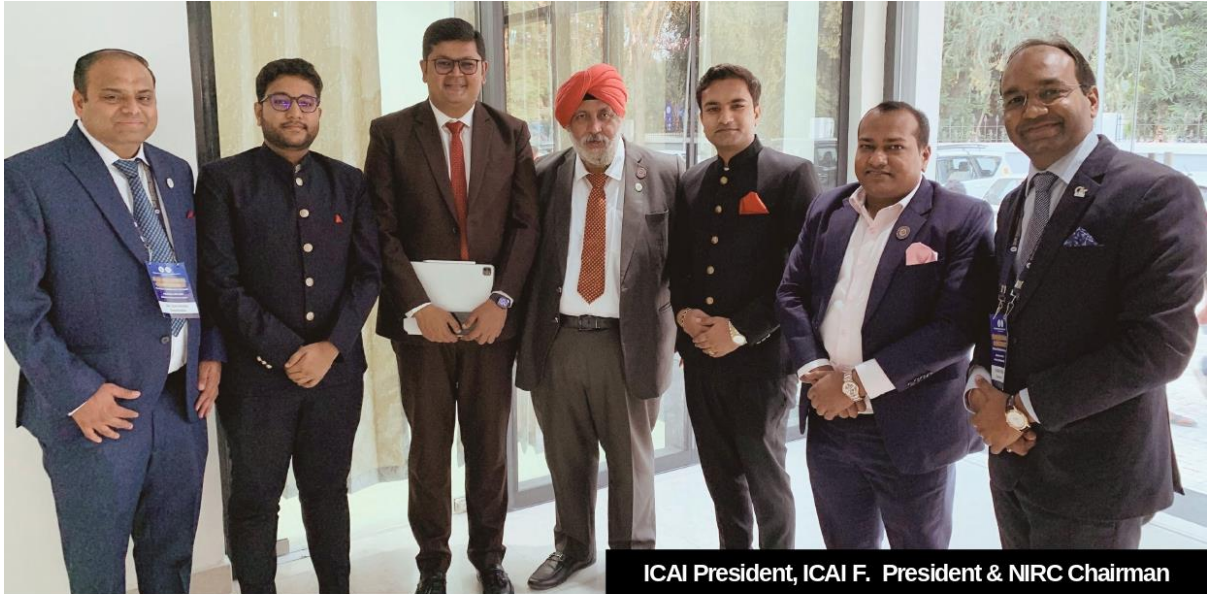
ICAI President, ICAI F. President & NIRC Chairman