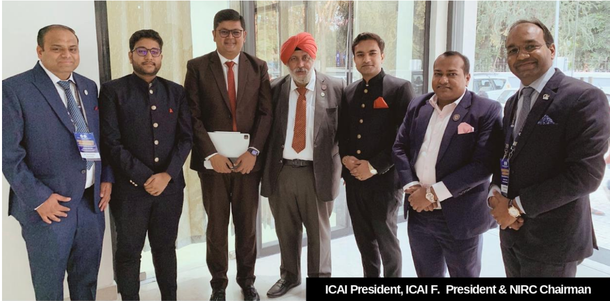
ICAI President, ICAI F. President & NIRC Chairman