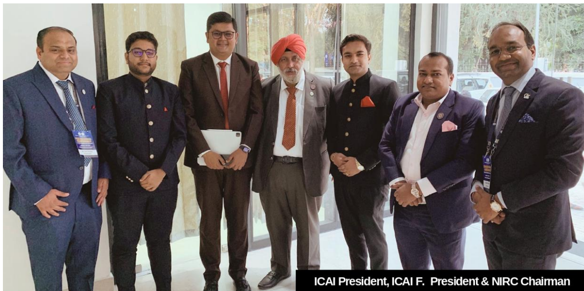
ICAI President, ICAI F. President & NIRC Chairman