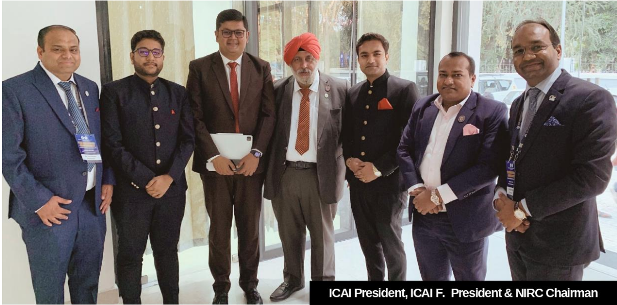
ICAI President, ICAI F. President & NIRC Chairman